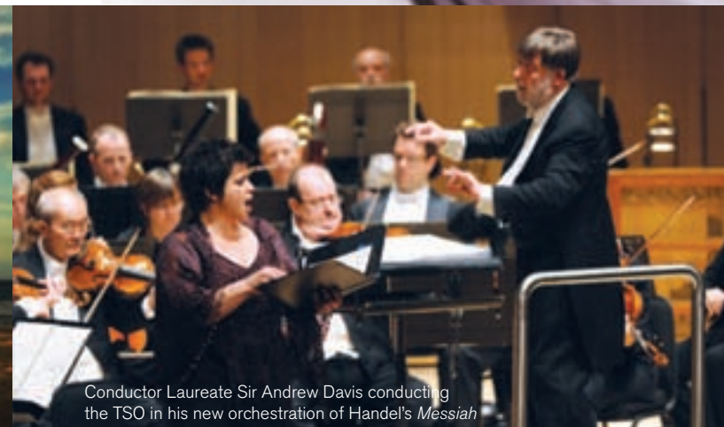
Conductor Laureate Sir Andrew Davis conducting the TSO in his new orchestration of Handel's Messiah