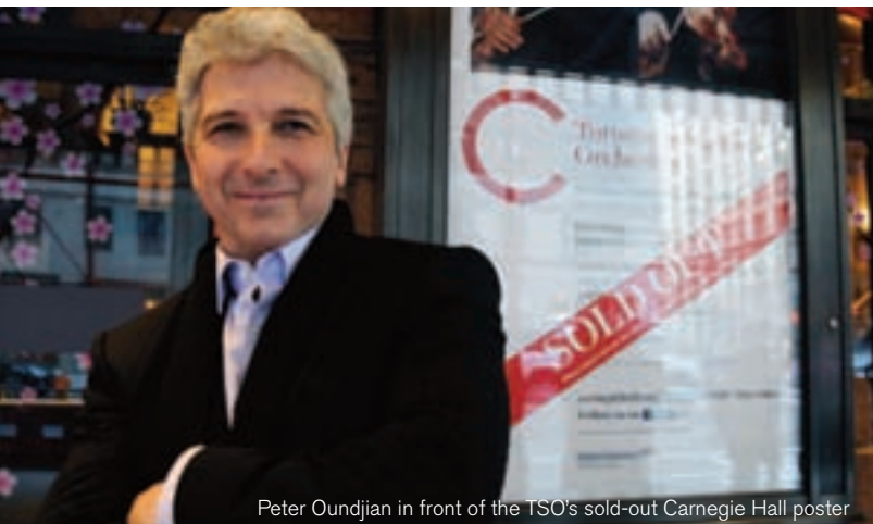
Peter Oundjian in front of the TSO's sold-out Carnegie Hall poster