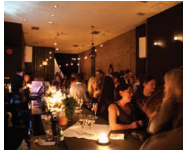
Young Leadership Event, Movies & Melodies , held at Bar Chef, February 2011