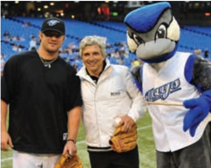
Music Director Peter Oundjian throws the first pitch at a Toronto Blue Jays Game, September 2010