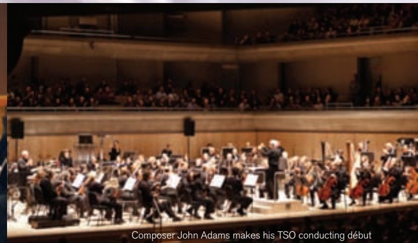
Composer John Adams makes his TSO conducting debut