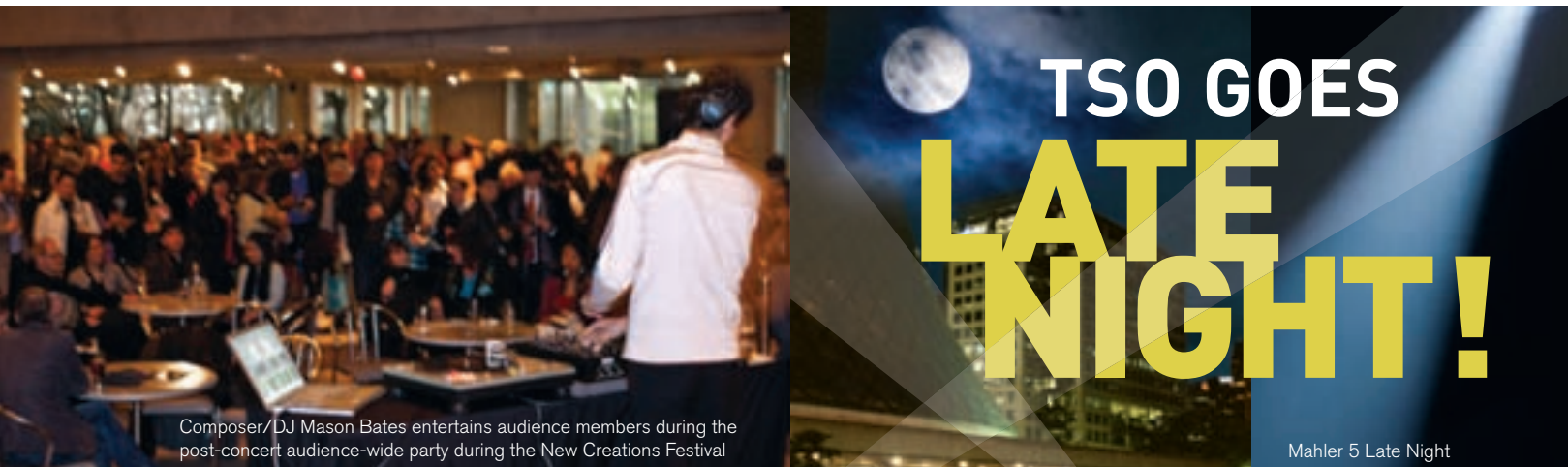
Composer/DJ Mason Bates entertains audience members during the post-concert audience-wide party during the New Creations Festival